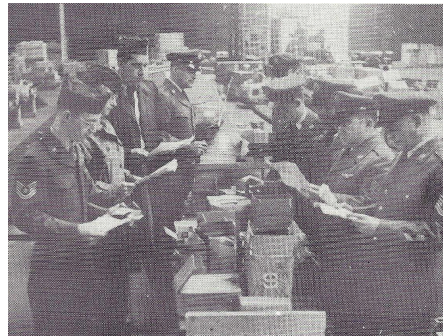
Warehouse 4, Sealand, Wales, 1954