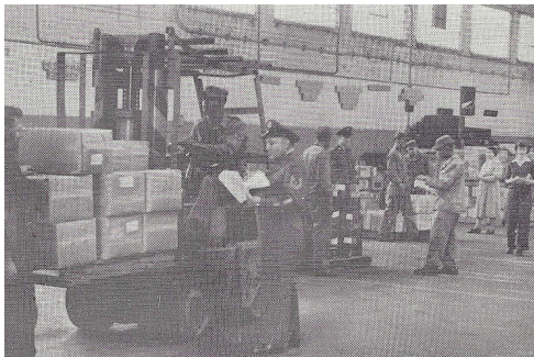
Shipping, Sealand, Wales, 1954