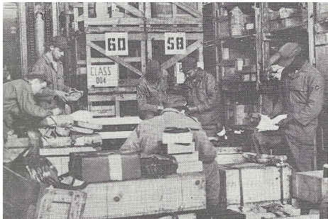
Engineer Warehouse, Sealand, Wales, 1954