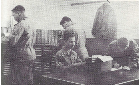
Warehouse 103, Sealand, Wales, 1954.