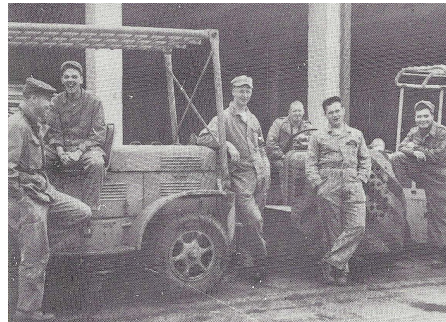
Facility Service, Sealand, Wales, 1954