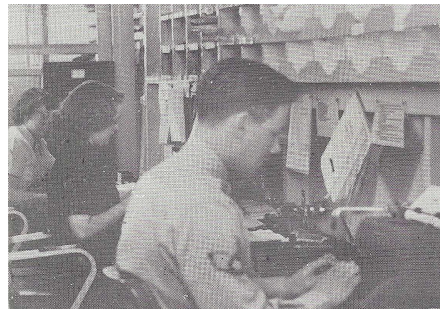
Message Center, Sealand, Wales, 1954

USAF Unit Histories Created: 16 Sep 2022 Updated: